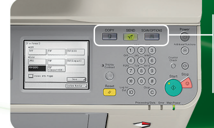
Quick Access Buttons Copy, Send, and Scan/Options buttons accelerate common workflows without having to navigate layers of screens.

For everyday copies or scans, users can scan individual pages on the platen glass or quickly tackle a stack of single- or double-sided originals using the optional 50-sheet Duplexing Automatic Document Feeder. The color scanning unit uses a compact and lightweight high-precision reader that makes crisp, clear reproductions.