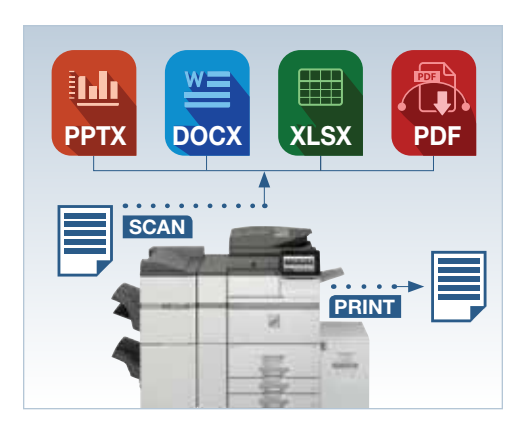
Scan and convert documents to popular file formats seamlessly with Sharp's built-in OCR function.