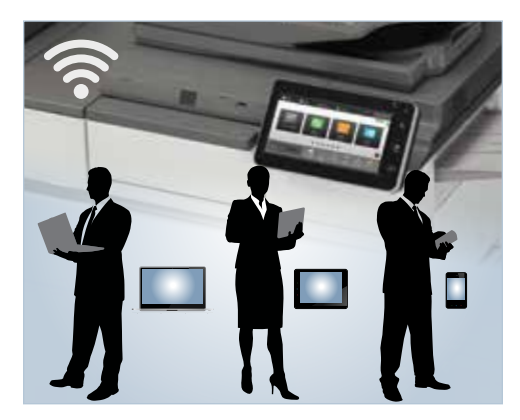
Built-in wireless network interface for convenient scanning and printing from mobile devices.