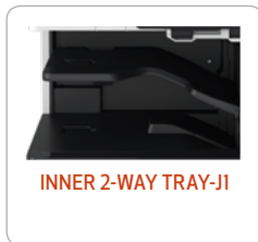
INNER 2-WAY TRAY-J1