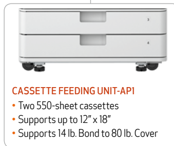
CASSETTE FEEDING UNIT-API