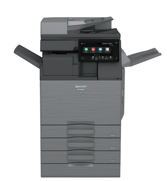
BP-50M45 shown with Inner Folding Unit, Right Side Exit Tray, and 2-drawer Paper Deck.