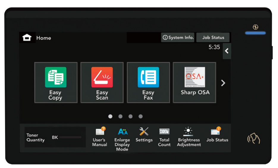
10.1" (diagonally measured) customizable touchscreen display.