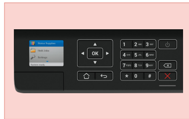
Easy-to-use 2.4" (diagonal) LCD panel.