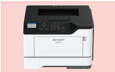
Standard desktop configuration shown.