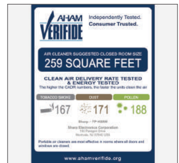
Sharp Air Purifiers are tested by independent laboratories to verify the air-cleaning capability of the filtration system