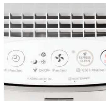
Patented Plasmacluster® Ion Technology reduces germs, bacteria, viruses, mold & fungus